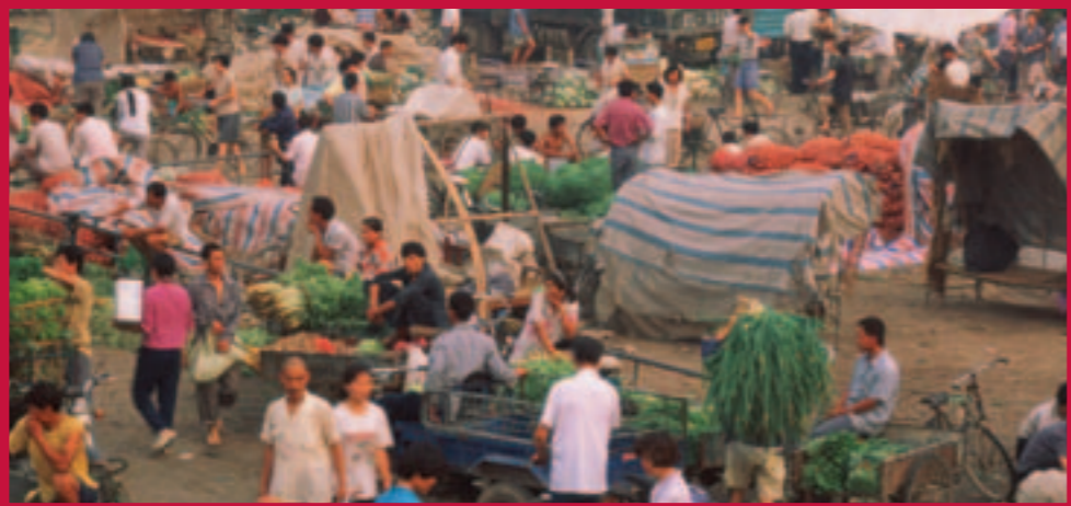
This is an outdoor vegetable market in the city of Xi'an. The agriculture industry provides nearly all the food needed to feed China's population.